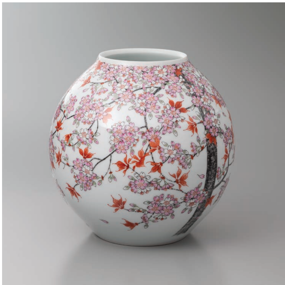
SAKURA with RED LEAVES Vase, 2018 h. 9 1/2 x dia. 9 1/4 in. (24 x 23.4 cm)