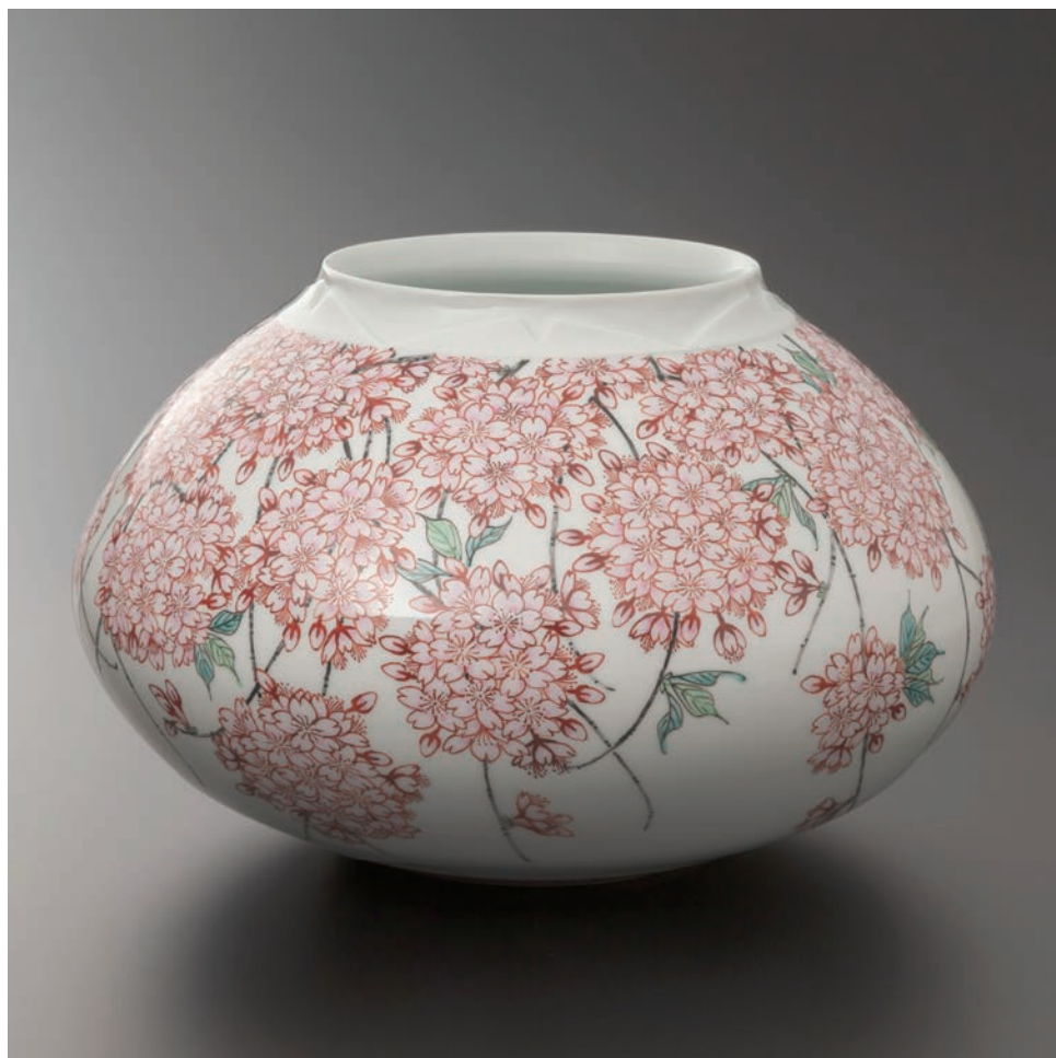
SHIDARE SAKURA Vase, 2019 h. 7 1/4 x dia. 11 in. (18.5 x 28 cm)