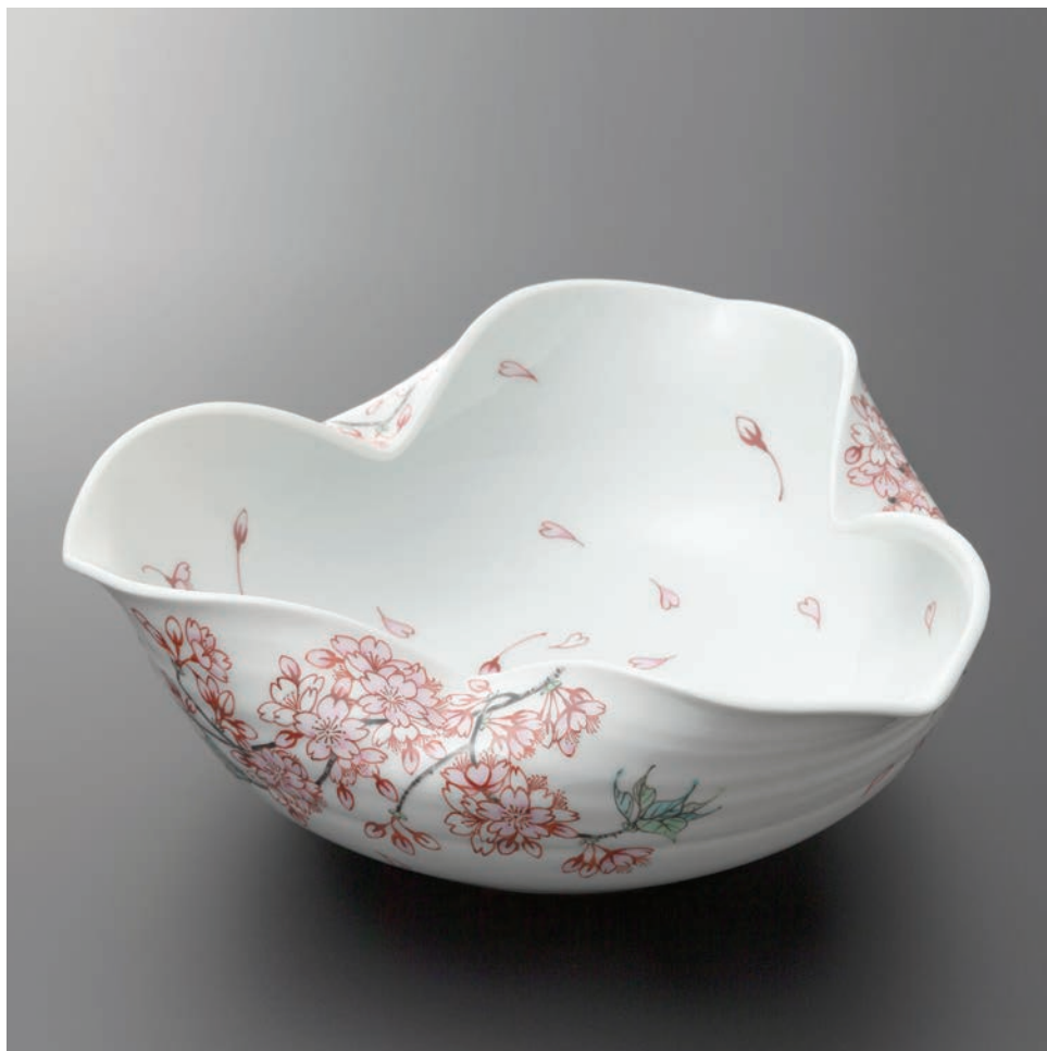
EDA SAKURA Vase, 2019 h. 4 x dia. 10 1/2 in. (10x 26.5 cm)