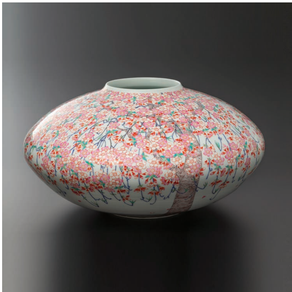
SHIDARE SAKURA Vase, 2018 h. 9 x dia. 15 3/4 in. (23 x 40 cm)