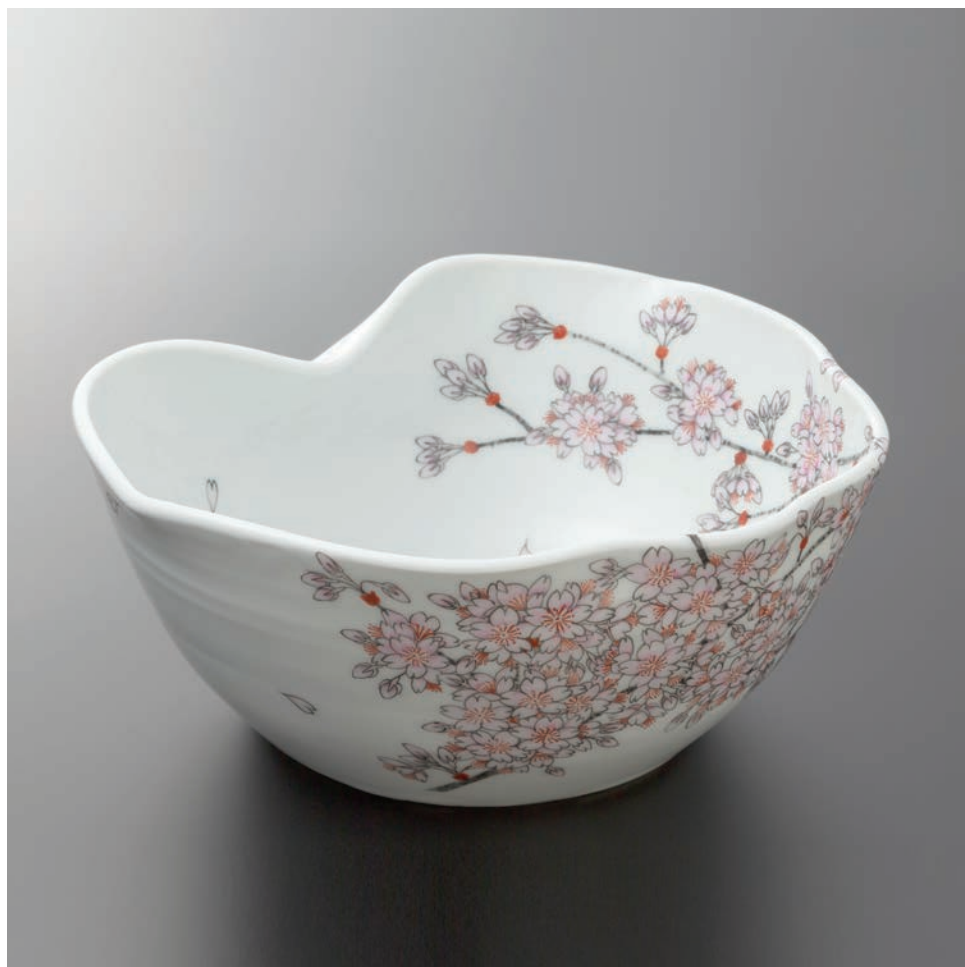
YAE SAKURA Vase, 2019 h. 5 1/4 x dia. 10 1/4 in. (13.5 x 26 cm)