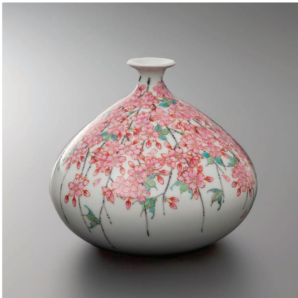
SHIDARE SAKURA Cone Shape Vase, 2019 h. 6 x dia. 6 in. (16.5 x 15 cm)