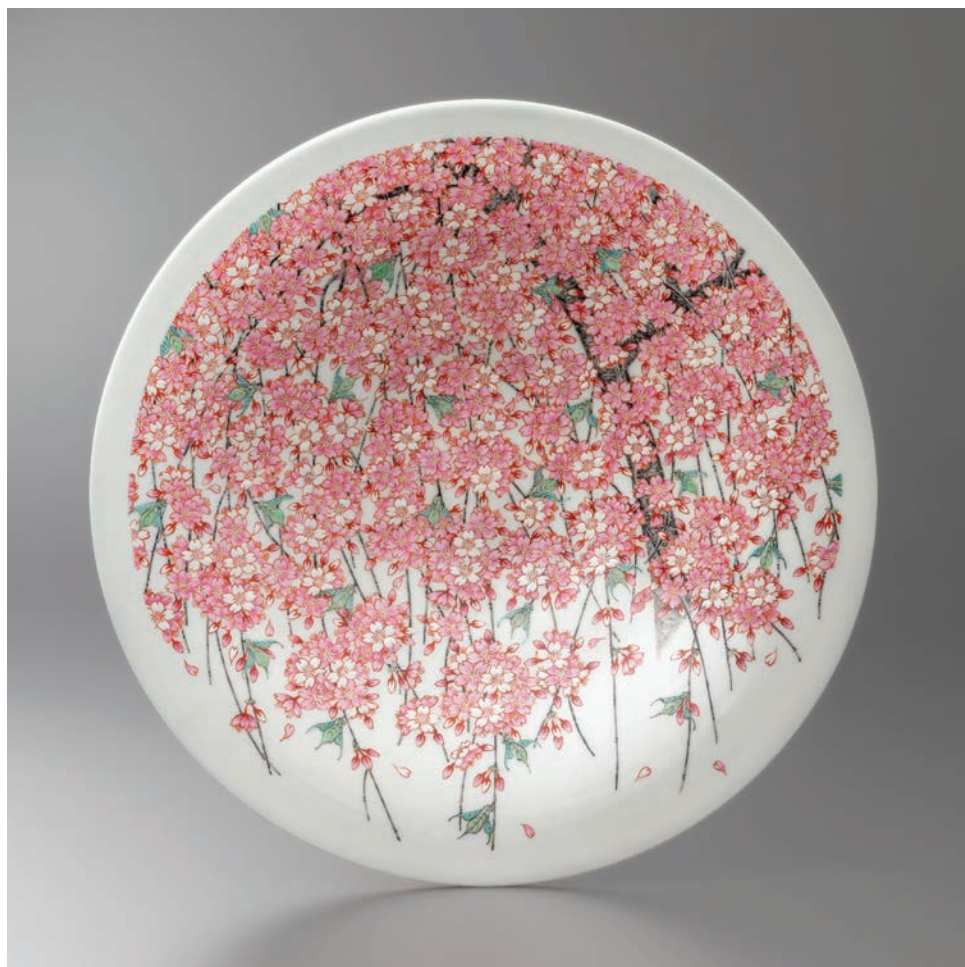
SHIDARE SAKURA Plate, 2018 h. 3 x dia. 16 in. (7.5 x 41 cm)