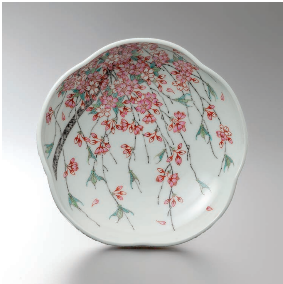
EDA SAKURA Pentagonal Plate, 2019 h. 3 x dia. 10 in. (7.5 x 25.5 cm)