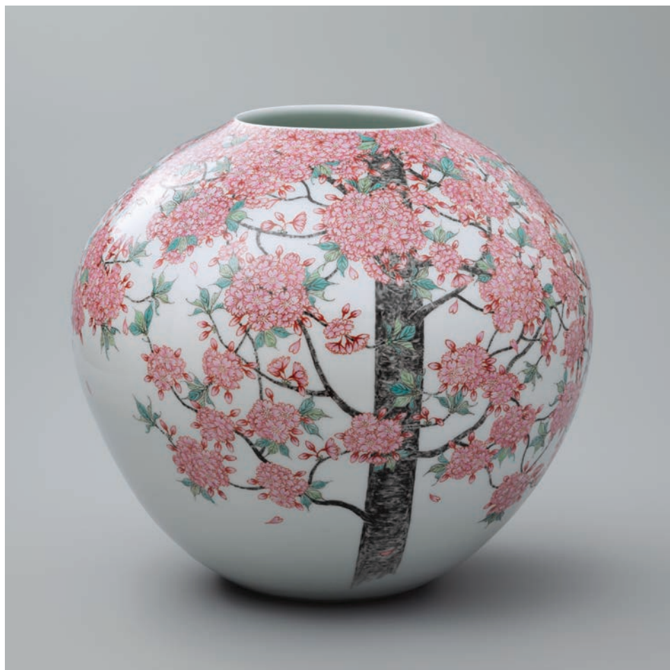
YAE SAKURA Vase, 2018 h. 14 1/8 x dia. 13 3/8 in. (36 x 34 cm)