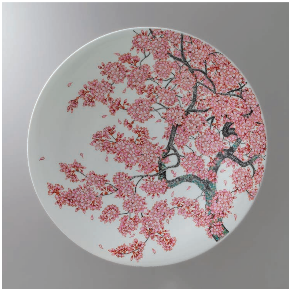
MIKI SAKURA Large Plate, 2019 h. 3 1/4 x dia. 18 1/2 in. (8.5 x 47 cm)