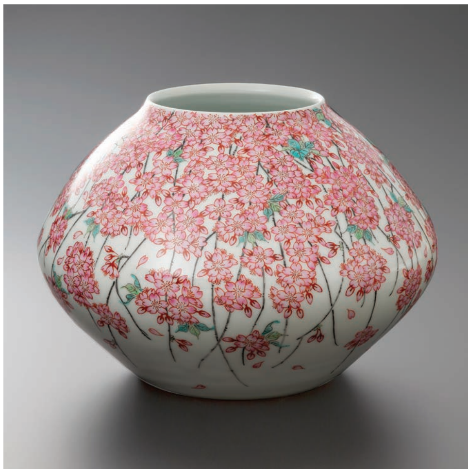
SHIDARE SAKURA Vase, 2018 h. 10 1/4 x dia. 7 7/8 in. (26 x 20 cm)