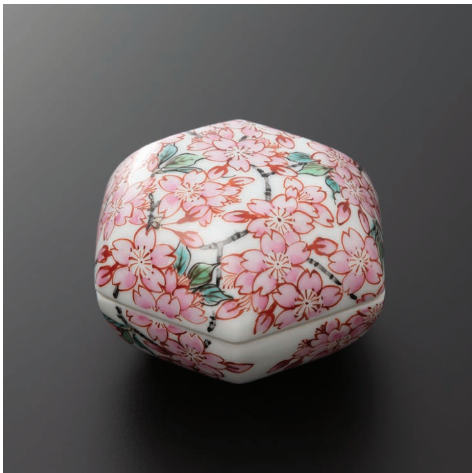
SAKURA TSUMEMON Incense Container, 2019 h. 1 5/8 x dia. 2 3/8 in. (4 x 6 cm)