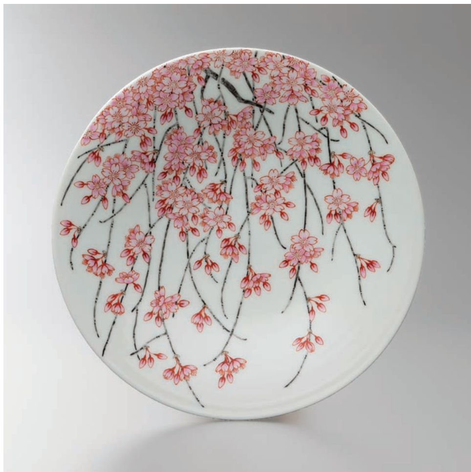
SHIDARE SAKURA Plate, 2019 h. 1 1/2 x dia. 11 1/2 in. (4 x 29 cm)