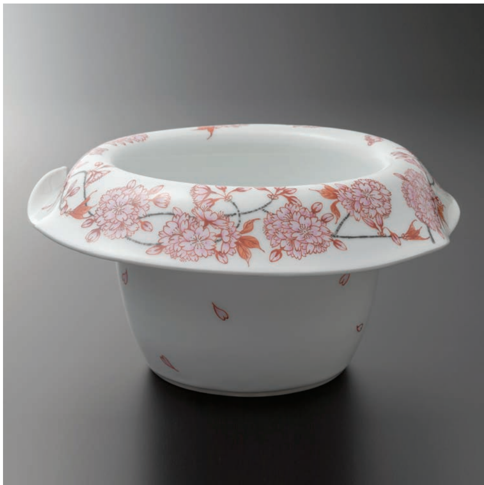
YAE SAKURA Vase, 2019 h. 5 1/4 x dia. 10 1/4 in. (13.5 x 26 cm)